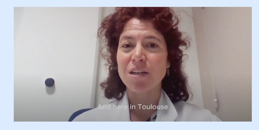
Watch the video here.

This insightful resource explores the clinical aspects of motor symptoms in PD, offering valuable knowledge for patients, caregivers, and healthcare professionals.